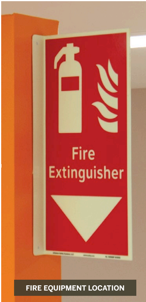
FIRE EQUIPMENT LOCATION